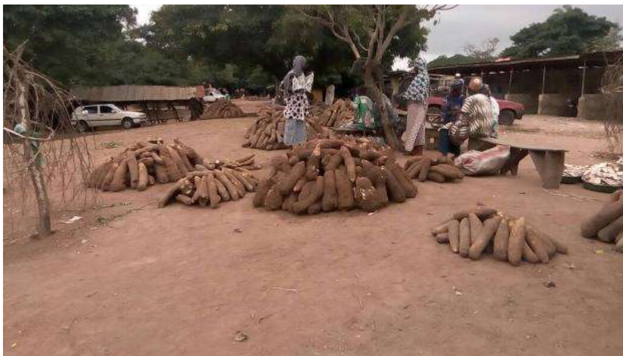
Agro Primary Market in Bauchi