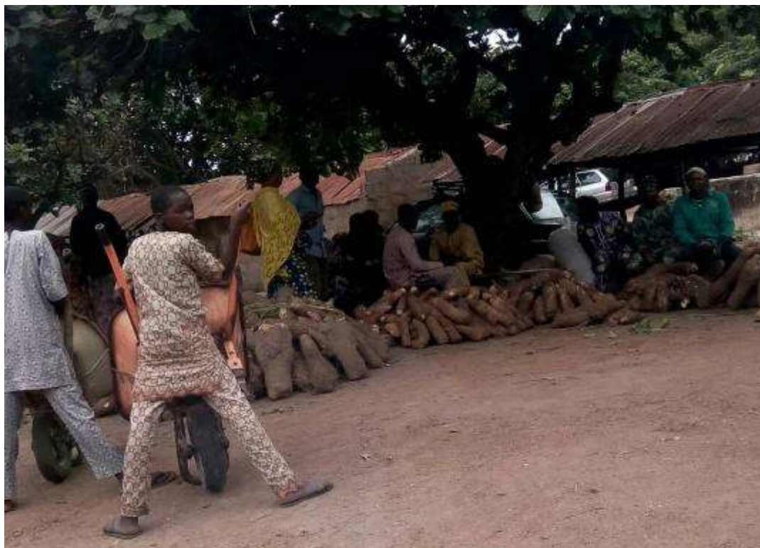
Agro Primary Market at Asa, Kwara State