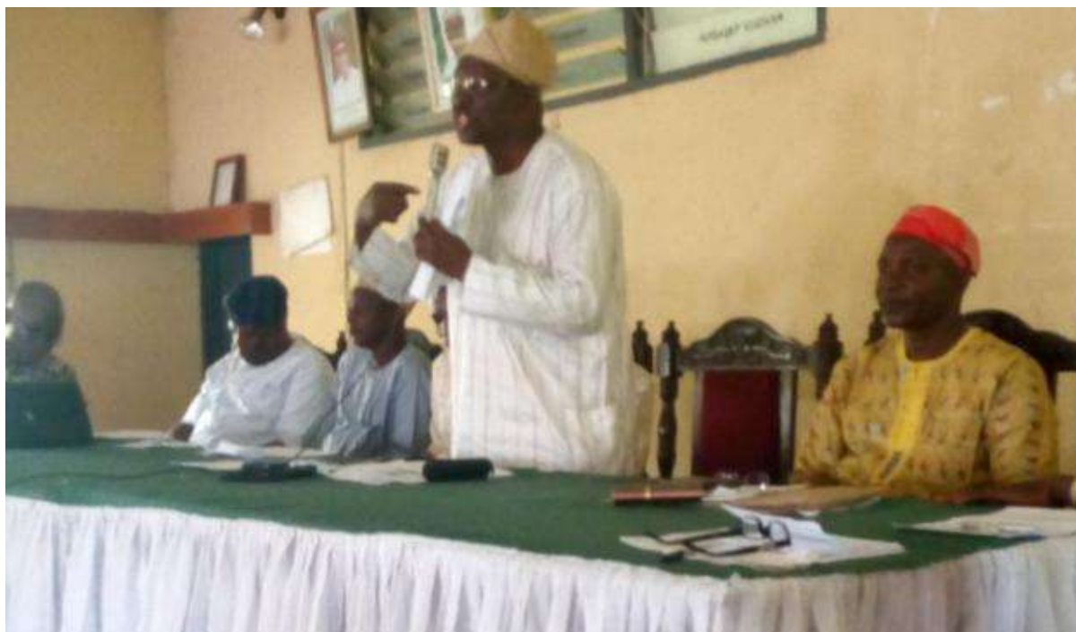
Stakeholders Workshop at Oyo State