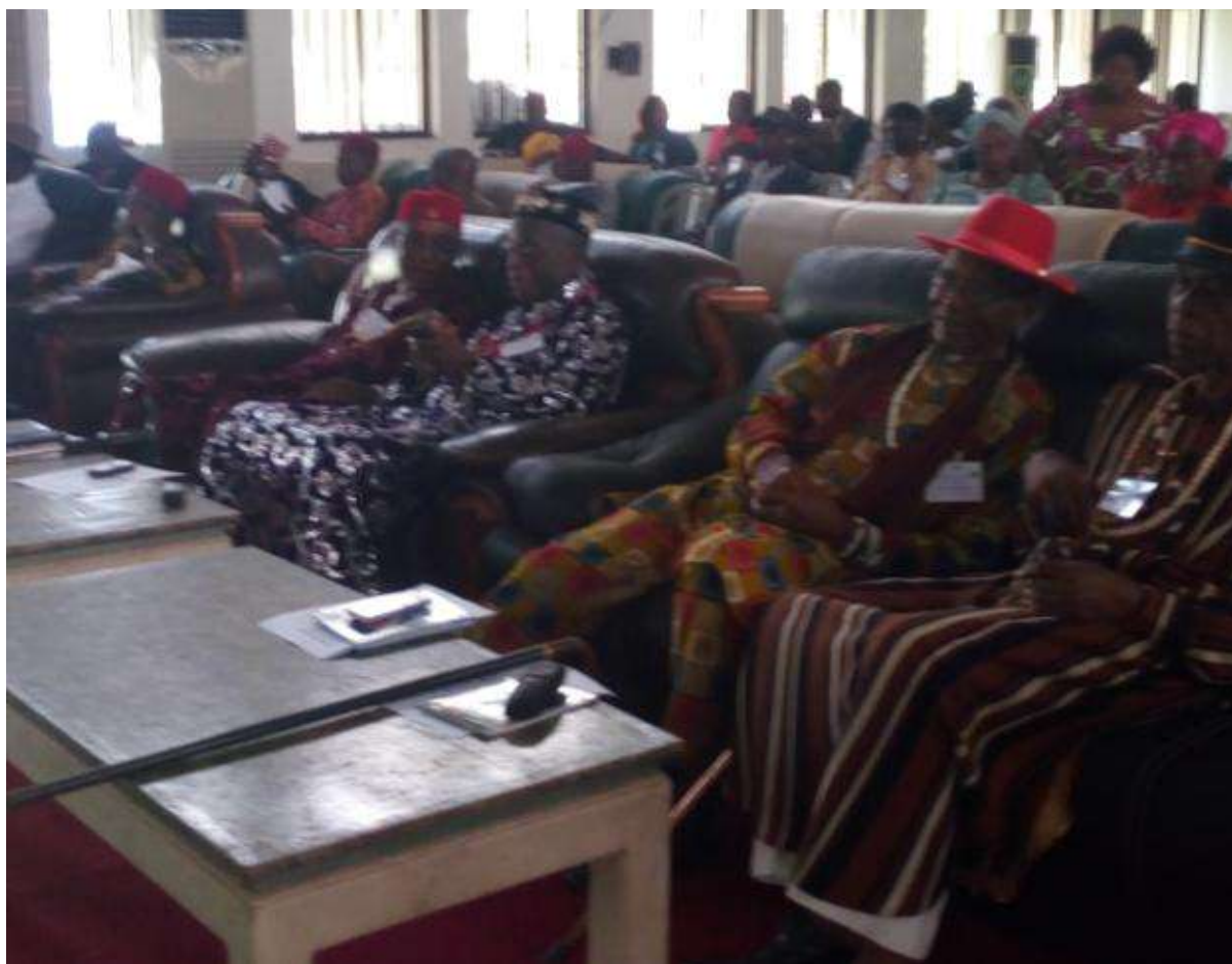
Stakeholders Workshop in Abia State